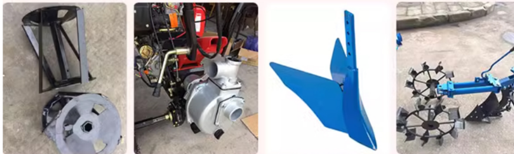
(5) Lawn mover