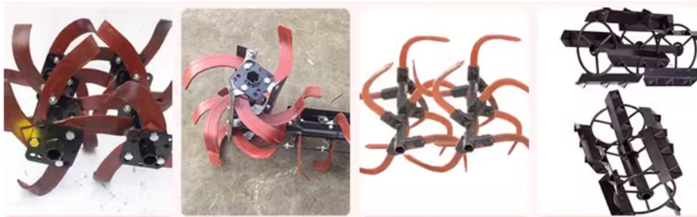
(1) Blade for dry land

The following working head are optional.